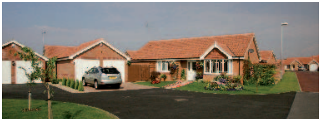
The impressive "Bembridge" bungalow justifies its position as one of Rippon Homes most popular bungalows.