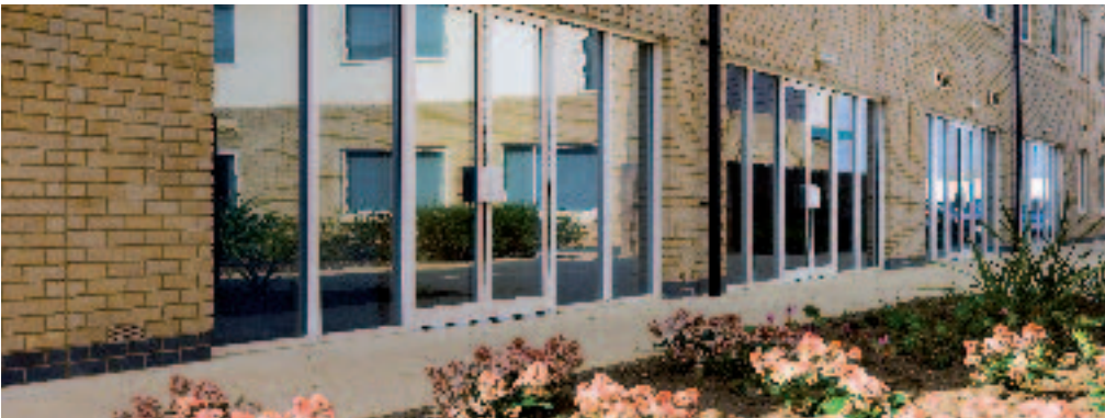
Appealing design at Vantage Business Park, Huntingdon.