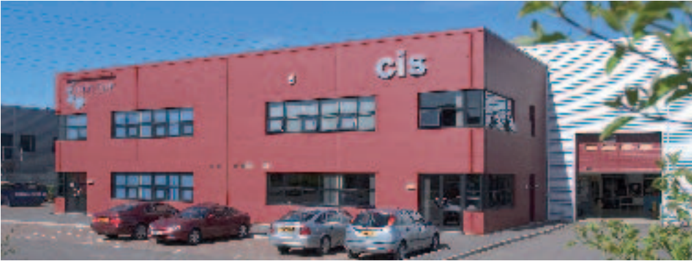
Light industrial units at Colmworth Business Park, St Neots.