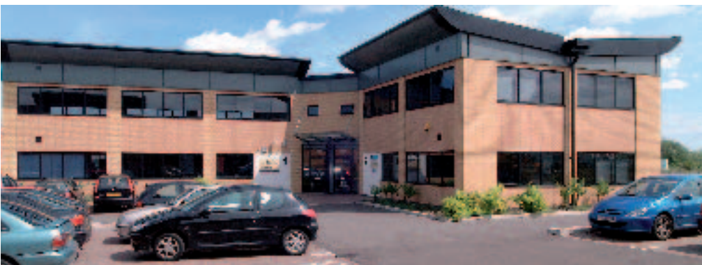
Two storey, long leasehold offices at Eaton Court, St Neots.