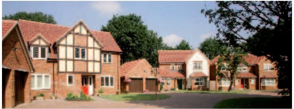
Award winning "Edgehill" development at Mansfield Woodhouse showcases Rippon Homes "Living Heritage" range.