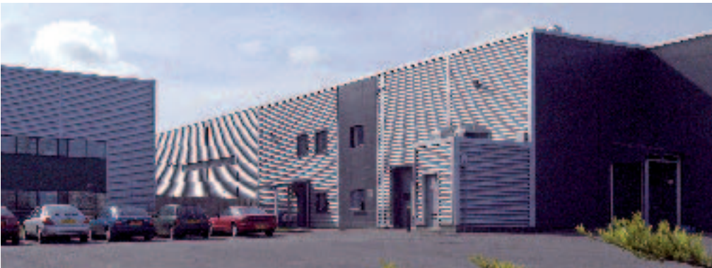
Bespoke headquarters and electronics manufacturing building at Colmworth.