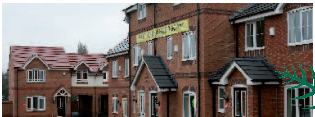
The carefully managed "Part Exchange" scheme provides our customers with the "Easy way to buy their new home".